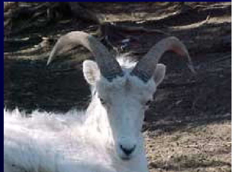
The Beast of the Earth