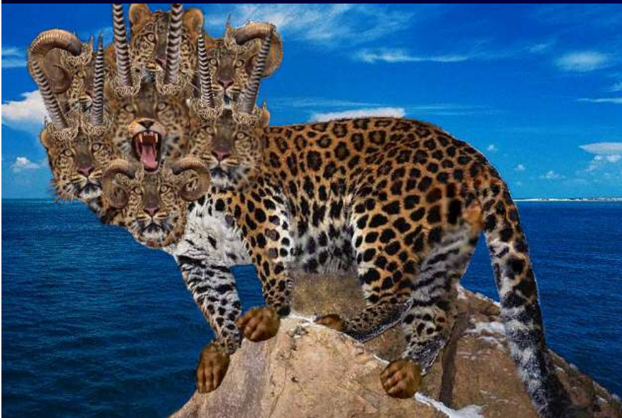
Revelation 13 – The Beast of the Sea